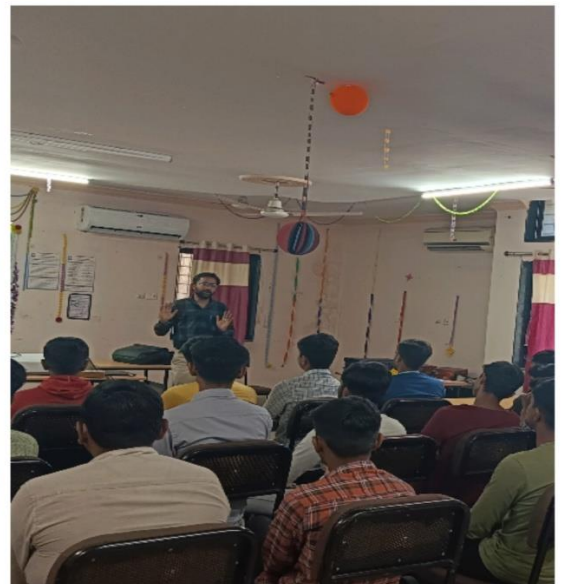
Lecture on: Basic Understanding on Public startups