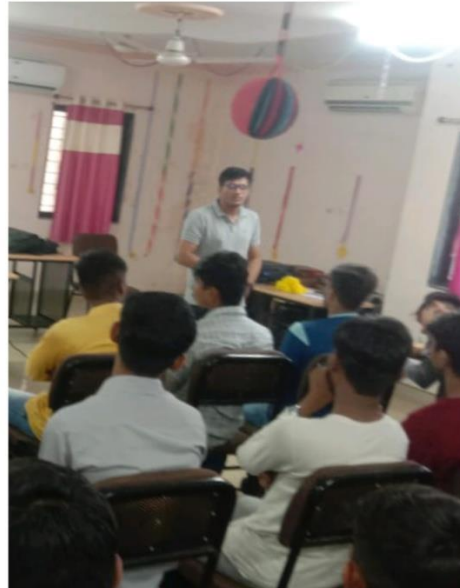
Hands-on practice on DMAIC-QFDTools